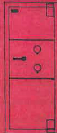
906 & 906ED*